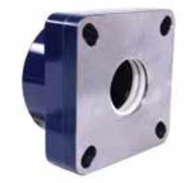
SOLID STEEL BACKING PLATE