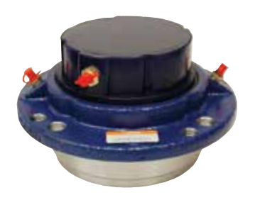
CLOSED Complete enclosure