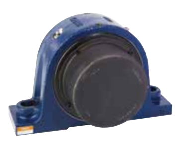
CLOSED Complete enclosure