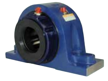
OPEN Available with contact seal

Ability to fill with grease for an extra barrier of protection