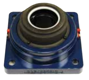
OPEN Open with labyrinth

Made from Black Oxide treated steel for durable protection from hard particle contamination and corrosion