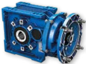
BA.. 2 STAGES Foot/Flange Mounting

DIFFERENT VERSIONS ARE AVAILABLE WITH HOLLOW OUTPUT SHAFTS AND SINGLE/DOUBLE SOLID OUTPUT SHAFTS.