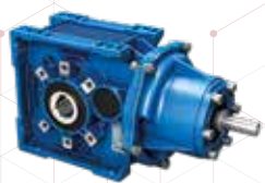
IBA With input shaft