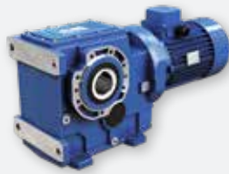
CB With compact motor