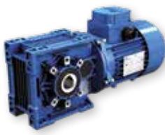
CBA With compact motor