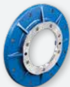
FB - FC - FD