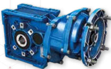
BA.. 3 STAGES Foot/Flange Mounting

DIFFERENT VERSIONS ARE AVAILABLE WITH HOLLOW OUTPUT SHAFTS. SINGLE/DOUBLE SOLID OUTPUT SHAFTS ARE ONLY AVAILABLE FOR THE BA70.