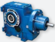
IB With input shaft