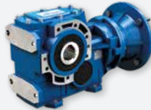
B... UC Foot/Flange Mounting