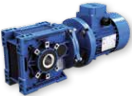
BA Fitted for motor coupling