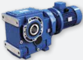
B-PB Fitted for motor coupling - Coupling with flexible coupling

The technological content of B-Series gear reducers allows for an extraordinary performance/lifespan ratio . These highly versatile gear units are successfully used in a vast number of industrial and civil applications. B-Series units offer excellent value for money and output torque/weight ratio , especially considering that they need very limited servicing. The units are available in cast iron (sizes 063 to 163) or aluminium (sizes A42 to A73) casing.