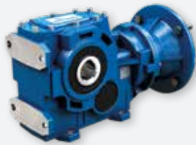
B... FC Foot Mounting

DIFFERENT VERSIONS ARE AVAILABLE WITH HOLLOW OUTPUT SHAFTS AND SINGLE/DOUBLE SOLID OUTPUT SHAFTS.