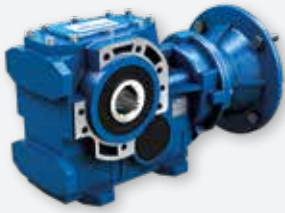
B... SC Flange Mounting