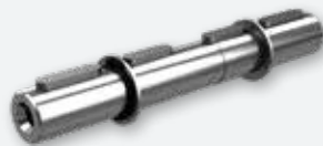
Double Output Shaft