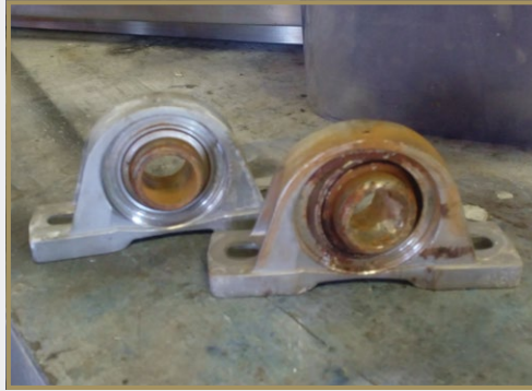
Competitor after 90 days in use.

On the left side, a competitor's bearing after 90 days vs. PEER Bearing after 2 years on the right side.