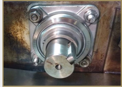
PEER Bearing after 2 years in use.