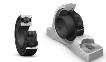
SKF 6212-2Z/VA228 SKF SY 50 TF/VA228

With grease removed from the process environment, relubrication procedures in potentially dangerous areas of the operation are no longer needed. Also, slippery surfaces from grease leakage and the risk of excess grease catching fire are eliminated. Versions of SKF high temperature bearings can also contribute to food safety as they are NSF H1 certified. See Core assortment table below.