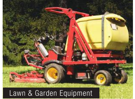
Lawn & Garden Equipment