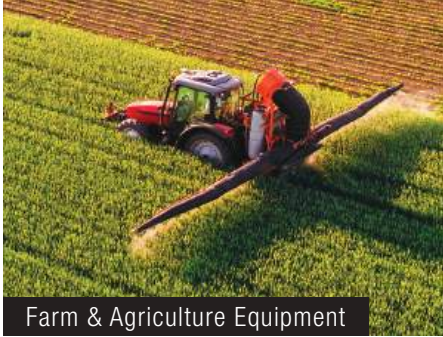
Farm & Agriculture Equipment