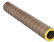
13" Continuous Cast Bronze Bars - Cored and Solid