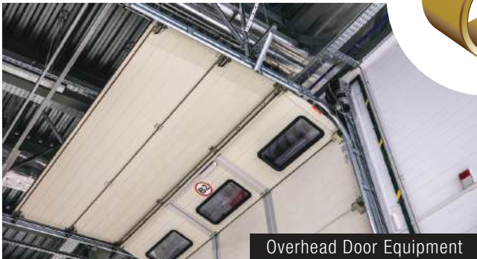
Overhead Door Equipment