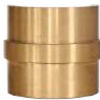
Custom Solutions are available for all bearings