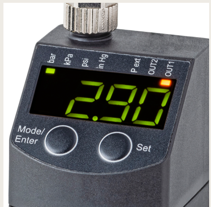
Easy to use Two colour configurable display for units of measure