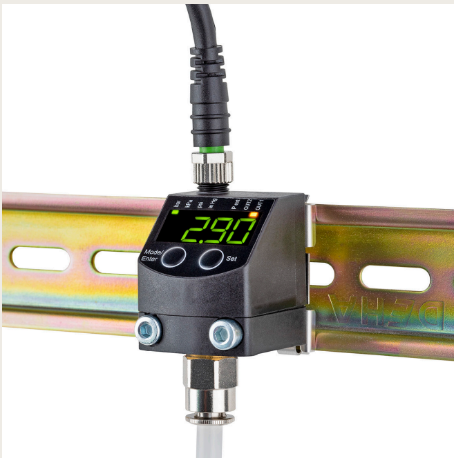
Easy Installation Mountable DIN rail option for control cabinet mounting