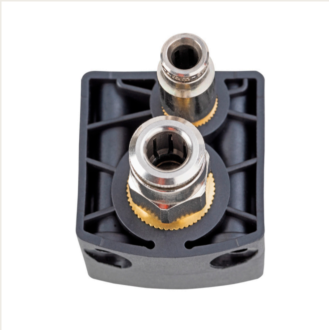
Differential pressure option Auxiliary pressure connection for differential pressure sensing