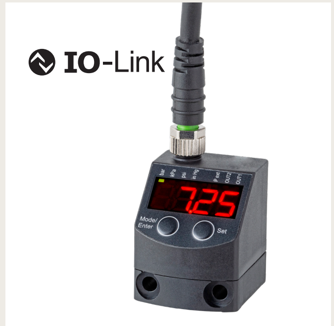
IO-Link Capability Application performance data